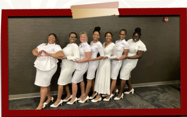
Spring '23 Initiates: 7 WondHERS of NEW

On April 5th, NEWAC received a Good Health Wins mini-grant. It will be used to continue to provide education on COVID and lifespan vaccinations within the Black community. On April 15, NEWAC welcomed "7 WondHERS of NEW " into our sisterhood. In celebration of Financial Literacy Month, on April 19, NEWAC and NeighborWorks Green Bay presented: Preparing Financially for Homeownership as part of the Smart Home Buying program. During the presentation mortgage readiness, affordability, budgeting, and credit were discussed. NeighborWorks Green Bay provided information about the services they provide, including down payment assistance.