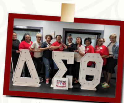
Sisterhood Month "Lunch with Sisters"