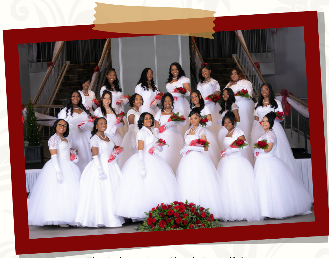
The Debutantes - Simply Beautiful!

The Teen Lift program for high school seniors concluded with the beautiful cotillion held in February. This year the celebration honored the 40th anniversary of the Teen Lift Program. The theme was "Radiant Rubies of Resilience." Nineteen Debutantes were presented with 753 guests present. The debutantes and escorts were recognized for their level of participation with various monetary awards. The highlight of the evening was the father/daughter dance along with the other choreographed dances.