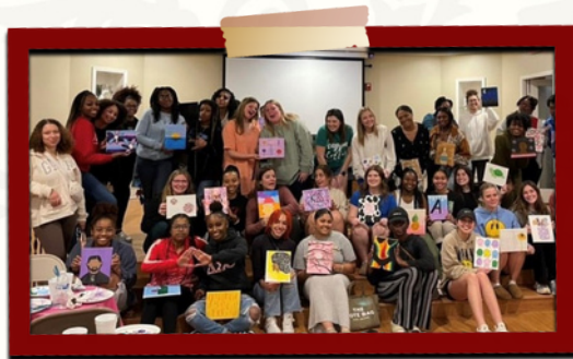
Attendees during Delta Week