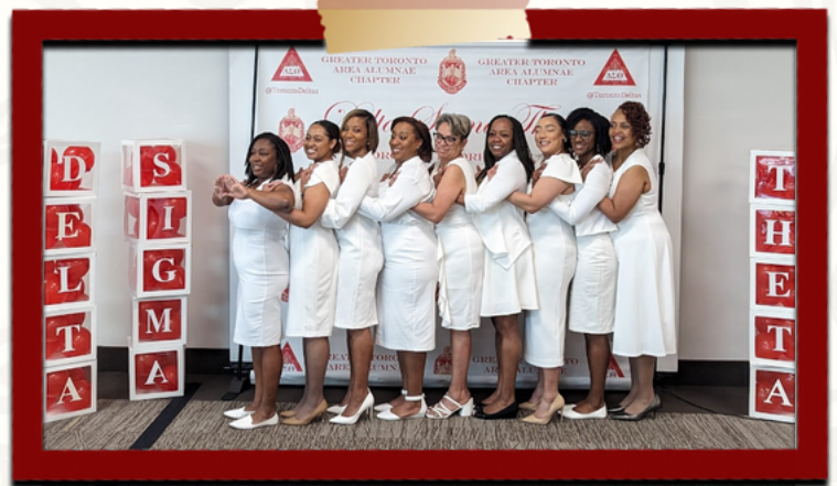
Spring '23 Initiates: Ali9ned 2 DSTiny