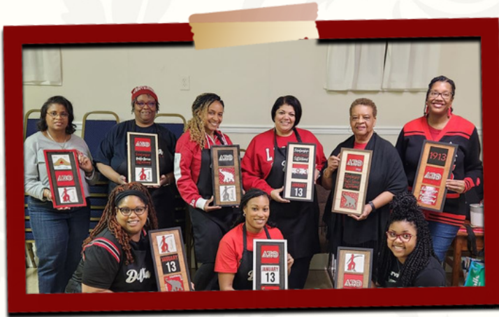
EPAC members pose with artwork during sisterhood paint night.

Each soror left the paint night feeling refreshed, renewed, and re-energized by spending quality time together. Sisterhood is one of the core values of our Sorority and EPAC is committed to continuing to provide engaging opportunities for its members to connect, grow, and lead together. EPAC is grateful for the Sunshine Committee who planned and implemented an amazing sisterhood event and looks forward to the next one!