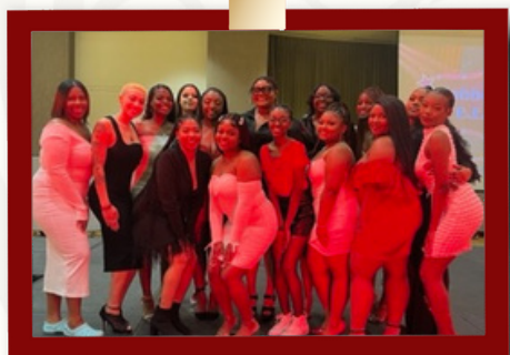
Members of the chapter at the conclusion of the annual Jabberwock during the spring semester.

The chapter concluded the school year by partaking in different community service opportunities visiting multiple middle schools in Ohio & Michigan, homeless shelters, and volunteering at conferences. Lastly, the chapter assisted with many different opportunities at the university such as MLK Day, Presidents Day, and visiting girl groups.