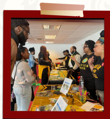
Representatives from Xavier University speak with interested students.