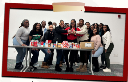
Act Out Against Hunger

The Lambda Chapter of Delta Sigma Theta Sorority, Incorporated, started the new year strong by hosting a week of events for Founders Week entitled Lambda Airlines: The Most Magnificent Skies. They began the week with their first Founders Day Mixer which was open to collegiates and sorors who were able to fellowship and celebrate 110 years scholarship, sisterhood, and service instilled by our Founders. Following the Founders Day mixer, they reflected on New Year resolutions and the importance of goal setting in an event entitled Lost and Found: New Year, New Me. In the middle of the week, they gave back to the community by hosting a canned food drive in their event, Concourse F: Act Out Against Hunger. The week of events wrapped up with the Emergency Exit: Post-Graduation Prep. They recognize that the transition from college into the workforce can be difficult to navigate, as it is unfamiliar territory. The purpose of this event was to educate and encourage the pursuit of higher education and understand what life could be like post-graduation. During the event, students were able to better understand and reflect upon what it means to define their own success and create their own path post-graduation. The Lambda Chapter was thrilled to host a successful week of events to not only promote education and goal setting but to also continue the Founders' vision of sisterhood and service.