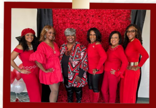
The Jazz Committee pose for the camera.