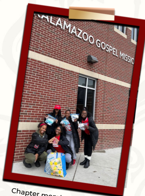
Chapter members donate to Kalamazoo Gospel Mission.