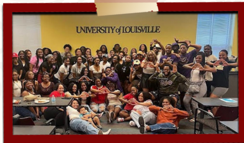
Attendees post after the Elephant in the Room: Sexual Assault Awareness program