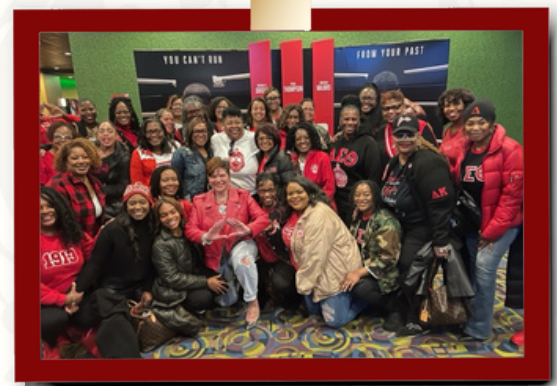
CAC hosts A Night at the Movies for sisterhood month.