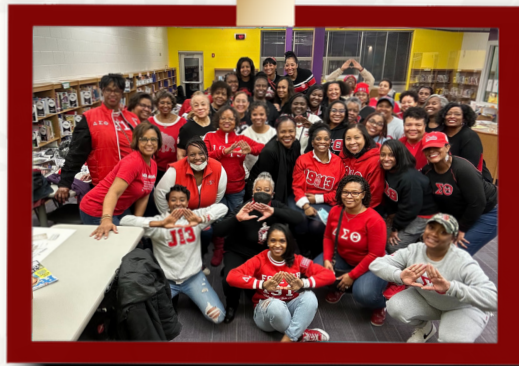
Sorors attending the Founders Day fellowship event.