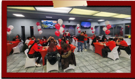
Founders Day Celebration

The Anderson-Muncie Alumnae Chapter had an amazing time celebrating the impact and enduring legacy of our Founders. On Friday, January 13, 2023, we gathered during "Forever 22 – A Founders Day Celebration" to remember the ideals of our Founders and embrace the Sisterhood we hold dear. Through remarks, games, and sisterly interaction, attendees were encouraged to remember the Twenty-Two, and chapter members were reminded to finish the Sorority year strong. The chapter also used this event as a collegiate connection and reclamation opportunity, with Delta Phi Chapter and other sorors in attendance.