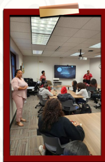
NEWAC members facilitate workshop for Appleton High School North students.