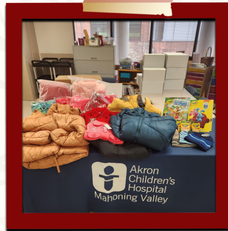
Youngstown Alumnae Chapter collected coats, crayons and coloring books for Youngstown Akron Children's Hospital patients.