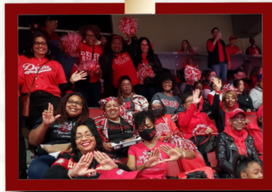
Louisville Alumnae engaged in a bonding activity with sorors and their families supporting the Louisville Women's basketball team at the UofL vs. Notre Dame game.