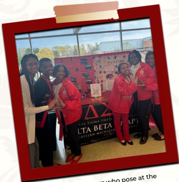
Delta Beta sorors who pose at the Autism Awareness display.