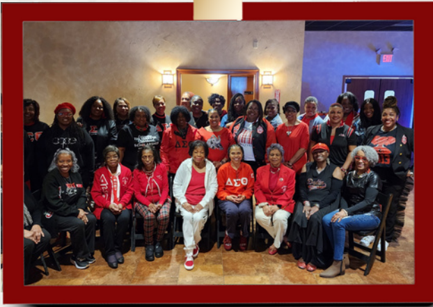
Youngstown Alumnae Chapter members pose at Soulfood Jazz Brunch.

Strengthening our sisterhood and serving our community are ever in the forefront of the efforts of YAC.