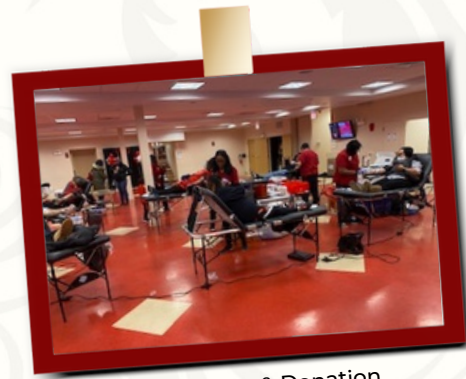
Book Drive & Donation

The service did not stop there! On January 16th, the chapter held it's inaugural MLK Day of Service Blood Drive. Physical and Mental Health, Emergency Response Team and Programming, Planning and Development committees collaborated with the American Red Cross to host the event. Sorors and members of the community donated 49 units of blood. Approximately 89% of the participants were first-time donors! The blood collected will save 147 lives! The event was such a success that the committees are already discussing how to make the event bigger and better in 2024!