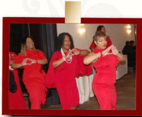
Stroll into 40th Anniversary

At Sunday's Rededication Ceremony and Luncheon, honor and gratitude were shown to BNAC's Charter Members, three of whom remain active BNAC Delta DEARS. Current and former chapter members celebrated loving sisterhood and reflected on our legacy of service to the community, which includes an annual health fair, social action community conversations, scholarships to local college/vocational school bound African American students, service with other D9 and community service organizations in addressing food insecurity and receiving multiple regional awards. BNAC is proud of the past 40 years and is moving Forward with Fortitude , building on a strong foundation of sisterhood and service!