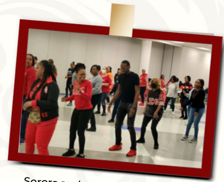
Sorors and community members hustling for heart health

During the event, participants were able to fellowship while learning the latest and most popular hustle dances. There was representation from all age groups from various cities and communities within the IAC service area. Proceeds from the event went to the chapter’s annual scholarship fund that benefits graduating local high school seniors. The chapter will continue the mission of “Empowering Our Youth and Communities” with the tools and resources they need to live a healthy lifestyle: mind, body, and spirit.