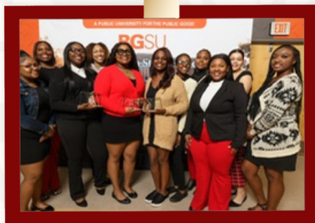
Chapter members pose at the Fraternity and Sorority Life Awards.