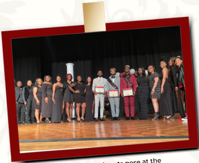
Sorors and participants pose at the Mr. Debonair Pageant

The chapter also hosted "What Was I Scared Of," a series of challenges and games where participants faced their fears. "Oh, the Thinks You Can Think" was another activity that aimed to inspire attendees to pursue their dreams and break negative thought patterns. The week concluded with a "Campus Clean Up" event, where the Alpha Pi Chapter engaged in community service to help keep the campus and environment clean.