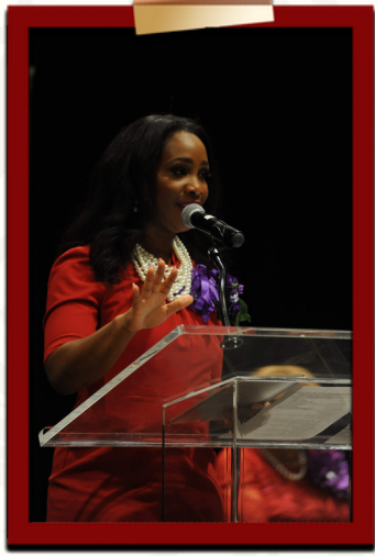
Founders Day Keynote Speaker, Soror Abby Phillip delivers keynote address.