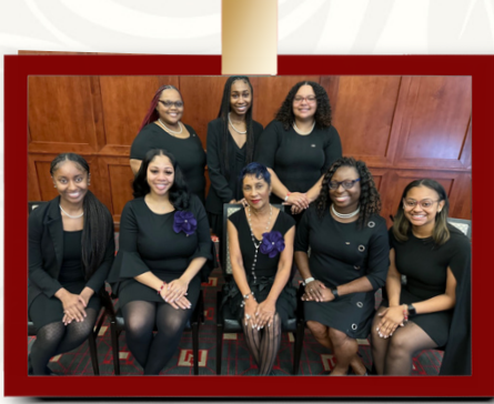
Sorors of Bowling Green Alumnae and Eta Zeta Chapter attending Rededication Ceremony for Founders Day 2023 in Bowling Green, KY.

Bowling Green Alumnae Chapter celebrated Founders Day in collaboration with Sorors of Eta Zeta Chapter of Western Kentucky University on February 25, 2023. A total of 23 Sorors were in attendance for the event. The day began with a Rededication Ceremony followed by fellowship with lunch at a local restaurant in Bowling Green, KY.