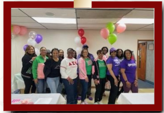
Macomb Alumnae Chapter sorors and members of the Omega Xi Omega Chapter of Alpha Kappa Alpha Sorority, Inc. pose at Book Drive.