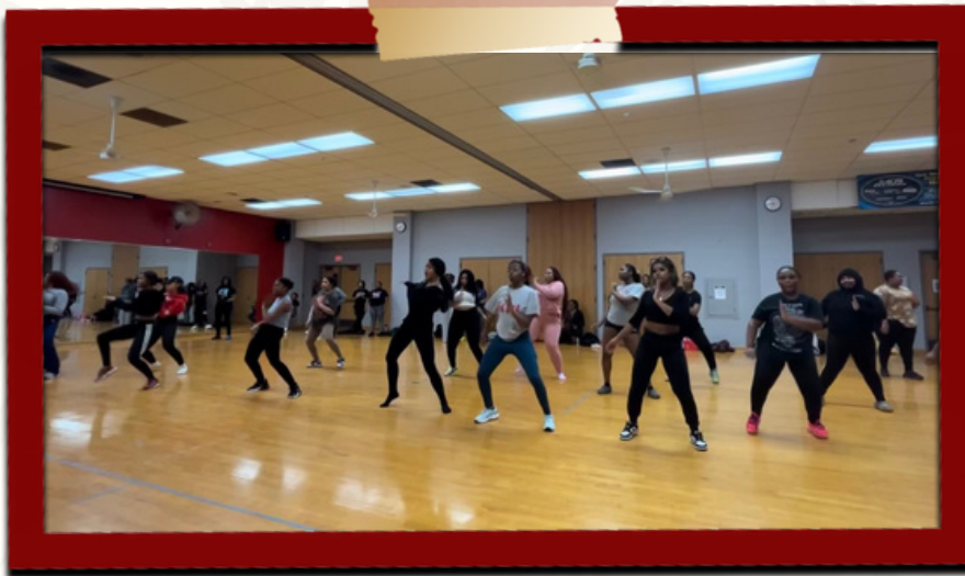
DanZing Around the World

Lastly, in support of the community, Zeta Iota held a Hygiene Drive on campus to collect products for donation to the local homeless shelter. They collected products such as soap, lotion, feminine products, hair care products, and more.