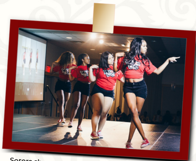
Sorors show owt at the Spring 2023 Stroll Off.

The Dynamic Delta Upsilon chapter hosted their annual Delta Week this year from April 17th to April 23rd. The theme focused on the television show, Wild-N-Out. In reflection of this theme, the chapter hosted close to one hundred attendees at events such as Family REDunion: Who They Introducing, Get Fit in the Classroom, Slanguage, and Know Your Rights. Family REDunion consisted of a meet and greet for the 15 newest initiates to the chapter. Get Fit in the Classroom is a Physical and Mental Health program. They provided the physical health portion through a Zumba class and the mental health portion was provided as a check in space to let the attendees know that someone is listening. Slanguage was a linguistics event where they taught common terms in Spanish, Chinese, and ASL. Know Your Rights was a discussion/presentation on being your own advocate when stopped by the police in various locations and scenarios. The Delta Upsilon chapter concluded their week with a win during the Spring 2023 Stroll Off.