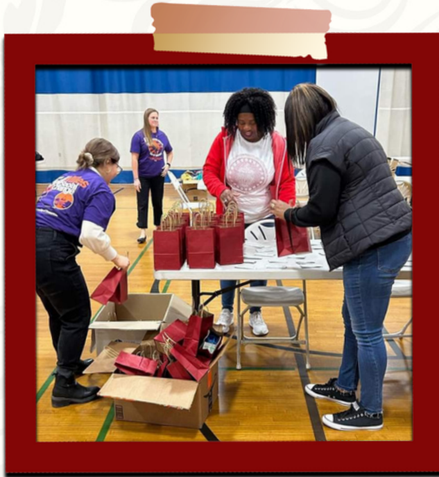
Outreach packages assembly

The chapter may be small in number; but its impact is felt in the Evansville community!