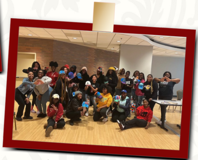
Attendees creating hats at the "500 Hats of a College Student" event.