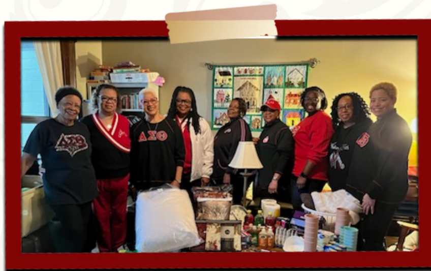
Wilberforce Alumnae Chapter members pose with donations for Schneider House of Hope shelter residents.

A quote from Denzel Washington reads. "At the end of the day, it's not about what you have or even what you've accomplished...it's about who you've lifted up, who you've made better. It's about giving back." On March 31, the Wilberforce Alumnae Chapter's Homeless Services Committee and the Healthy Lifestyle Committee conducted a joint community service project during Sisterhood Month at the Schneider House of Hope in Xenia, Ohio. The chapter collected and donated clothing, household items and personal hygiene items from chapter members for the residents at the shelter. The household items are gifted to the residents when they establish independent housing. Channel 2 News Station of Dayton, Ohio which is an ABC affiliate, featured the community service project on their station encouraging viewers in the Tri-state area to volunteer or donate items to the shelter. The feature also spotlighted how Delta Sigma Theta Sorority, Inc., has a longstanding tradition of strengthening families in the communities. In addition to the donated items, the chapter served a healthy nutritious meal to the residents that evening. Eleven chapter members participated in this community service project and 20 residents were served.