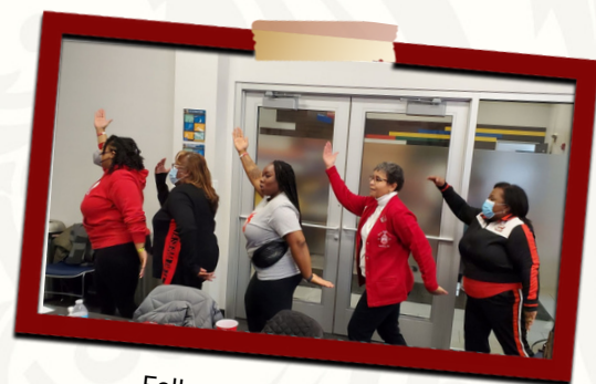
Fellowship & Teambuilding

Inspired by the themes of the retreat, the new initiates spearheaded the chapter’s effort to support domestic violence survivors. Donations of clothes and personal care products were collected for residents of the YWCA Women’s shelter. With H.I.N.G.E as a foundation, and the celebration of our individual and collective talents, Evanston-North Shore Alumnae continues to move forward with fortitude, guided by empathy, compassion and sisterly bonds.