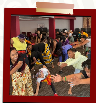
Members of the community at the African Dance Workshop

The March 11th HBCU College Fair allowed DAC to expose nearly 700 high school youth to the Black college experience – with all the tradition and support they have to offer. Open to metro Detroiters, the Fair was held in collaboration with 22 HBCUs and the Divine 9 organizations. Attendees were afforded the opportunity to receive direct access to college recruiters, onsite application assistance and onsite scholarship awards. Students and parents benefitted from educational presentations, including from a college prep coordinator. Information tables for community partners featured the Detroit Branch of the NAACP.