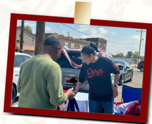
The Joseph Center

East St. Louis Alumnae Chapter (ESLAC) members commemorated 110 years of service during this year's Founders Day celebration, Raising the Torch: A Celebration of 110 Years of Sisterhood, Service, Scholarship and Social Action. The over 200-member chapter hosted an Amazon donation drive supporting The Joseph Center in East St. Louis providing basic need items to homeless veterans. Members also worshipped together on January 15 at New Life Community Church.