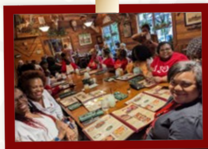
Sorors fellowshiping over lunch.