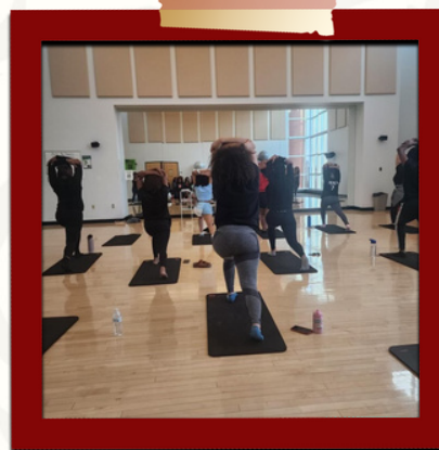
Attendees de-stress with yoga at Physical & Mental Health collaboration with Omega Psi Phi, Fraternity, Inc. Phi Theta Chapter.