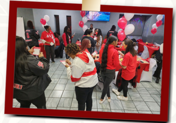
Founders Day Celebration