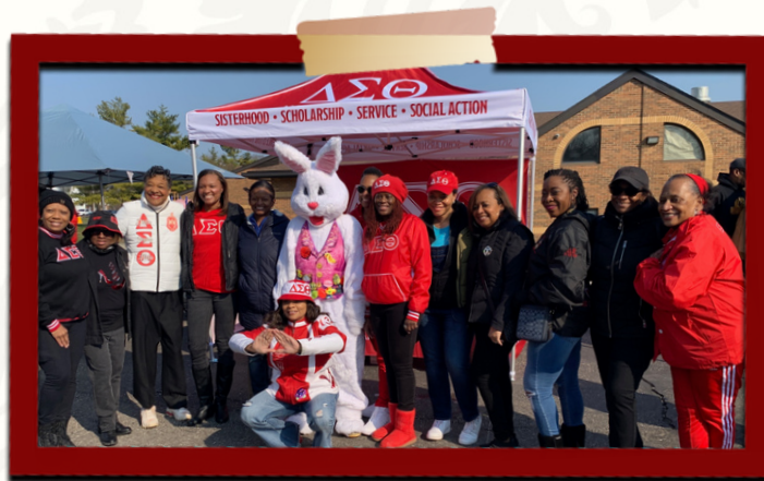
Members of the Ann Arbor Alumnae Chapter of Delta Sigma Theta Sorority, Inc.

Additionally, the Ann Arbor Deltas in collaboration with the Washtenaw County Divine Nine organizations and the Black community businesses hosted its' annual community Easter Egg Hunt. The Ann Arbor Alumnae Chapter hosted more than one hundred 4- and 5-year-old community kids and provided over 300 eggs filled with candy, age-appropriate books, toys, and games to participants. Additionally, they provided two giant Easter baskets to the children that found the gold egg (girl) and the silver egg (boy). Adult attendees learned more about our chapter history, purpose and signature programs and events.