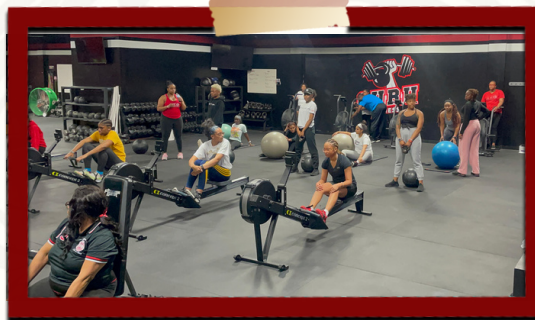
Attendees getting ready to start the next circuit.