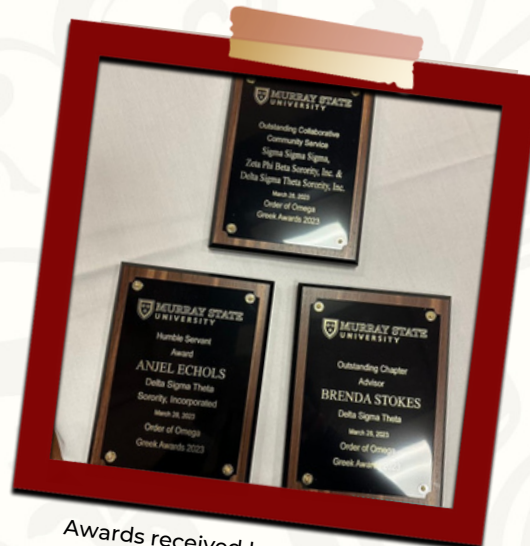
Awards received by Eta Upsilon