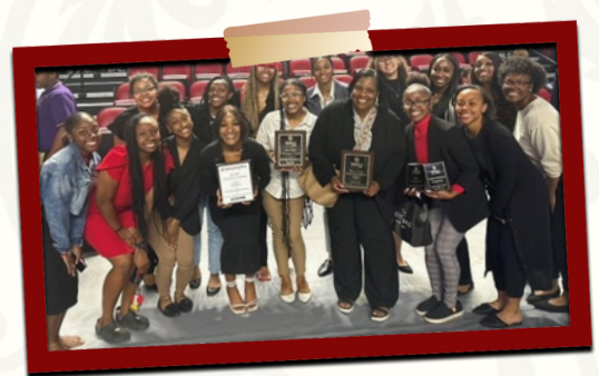
Sorors receiving Greek Awards.