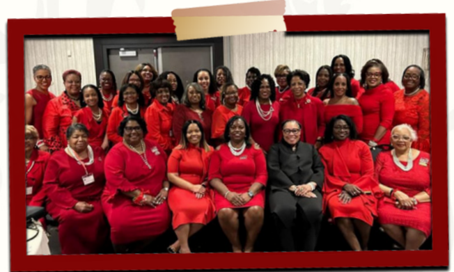
21st National President Soror Marcia Fudge