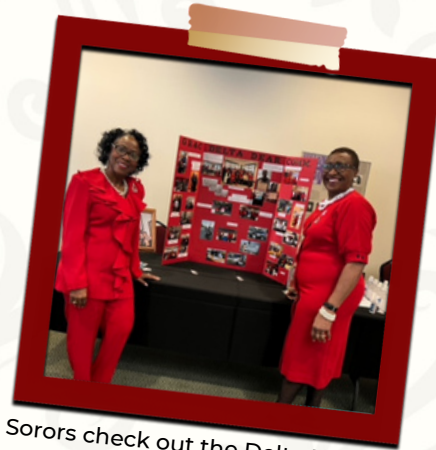
Sorors check out the Delta DEARS display

“Back Together Again” united the community for one cause, reaffirming that GRAC of Delta Sigma Theta Sorority, Inc. is the public service organization that continues to strengthen and influence the African American Community.