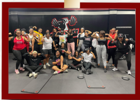
Delta Fitness attendees feeling strong after a good workout.