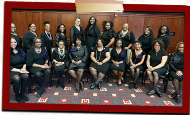
Sorors attending Rededication Ceremony for Founders Day 2023 in Bowling Green, KY.