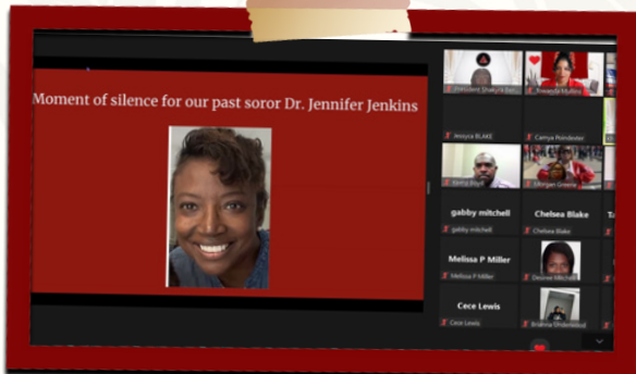
The PMH event was held over a zoom environment. Zeta Alpha held a moment of silence for soror who has passed on.

The Zeta Alpha Chapter held a Q&A at the end of the event to ensure that all guest inquiries were addressed. The post event survey indicated that this event was overwhelmingly successful.