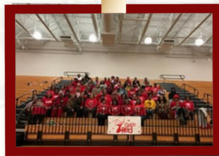
Sorors of Hopkinsville Alumnae Chapter attending Pink Goes Red with Beta Rho Omega Chapter of Alpha Kappa Alpha Sorority, Inc.

In honor of Women’s History Month, the chapter used social media daily to celebrate powerful women in their service area who are working and serving to bring improvement to their communities. In April, Hopkinsville Alumnae gathered over 50 blankets and throws and sorors spent an afternoon distributing them to residents at a local nursing home. The chapter believes in self-care and took the opportunity to love on each other during a sisterhood gathering where they had lunch and shopped at Patti’s 1800’s Settlement in Grand Rivers, KY.