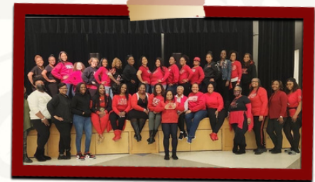
Sorors and community members pose after the Hustle for Heart Health program.