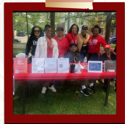
Sorors pose at the Antonio Franklin Jr. Community Intervention Peace Walk.