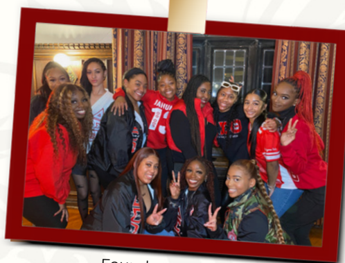
Founders Day Mixer