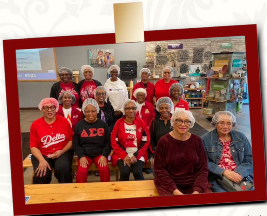
Delta D.E.A.R.S. after completing their service project

Our amazing Delta D.E.A.R.S. hosted an April service activity for Feed My Starving Children. They packed and labeled over 40 boxes with over 9,000 meals that will feed 25 children for one year. They continue to demonstrate the power of remaining active and involved in our community. We love our beautiful Delta D.E.A.R.S.!