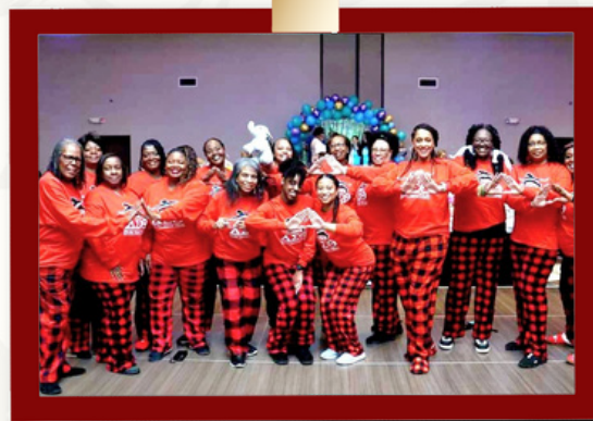
Genesis House Pajama Party