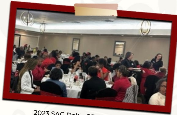
2023 SAC Delta GEMS Banquet