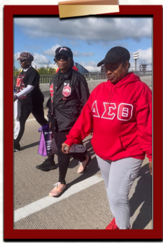
Sorors walk in March of Dimes Fundraising Walk.