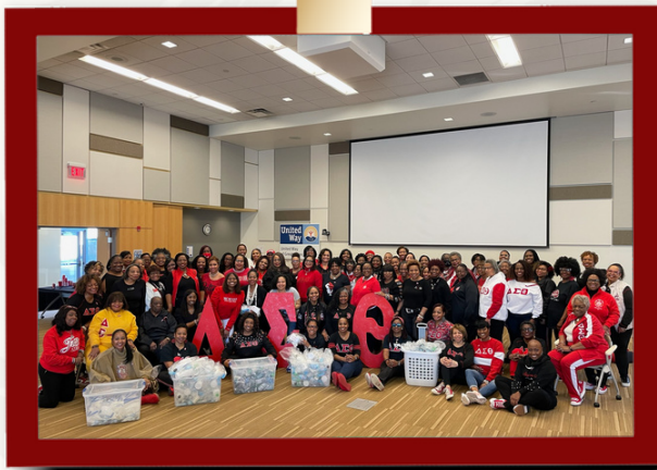
Sorors gather for Sisterhood Saturday with games and a service project.